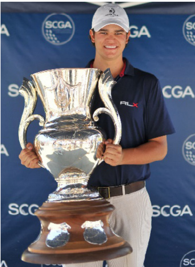
Beau Hossler (2013, 2014)

Among those who have tried to win the SCGA Amateur and failed are Craig Stadler, Scott Simpson, Corey Pavin, Mark O'Meara, Phil Mickelson, Duffy Waldorf and Jason Gore.