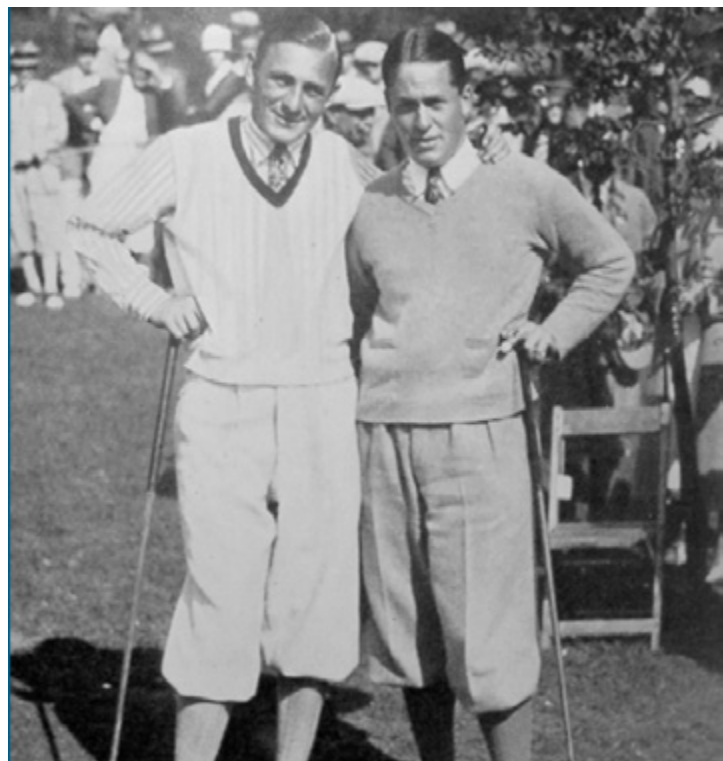
George von Elm (1922, 1925, 1927)

A match play format was used for the first 58 years of the tournament. In 1957, the format was changed to 72 holes of stroke play. In 1973, increasing interest and the number of entries resulted in regional qualifying with a 36-hole finale. The 72-hole stroke play format was reinstated in 1974. In addition to the championship itself, for many years the tournament also had net competition in flights. However, due to the increasing popularity of this portion of the tournament, a separate SCGA Amateur Net Championship was created in 1993.